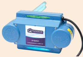
Fixed Mount - Part number: FM1-16