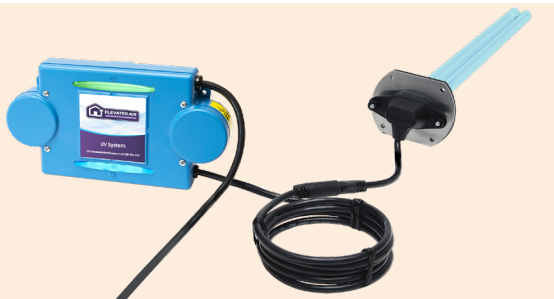
Remote Mount - Part number: RM1-16